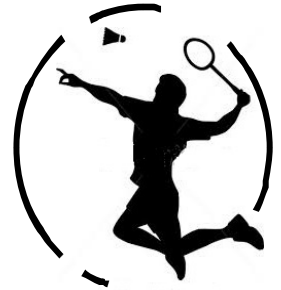
Khelgaon Badminton League